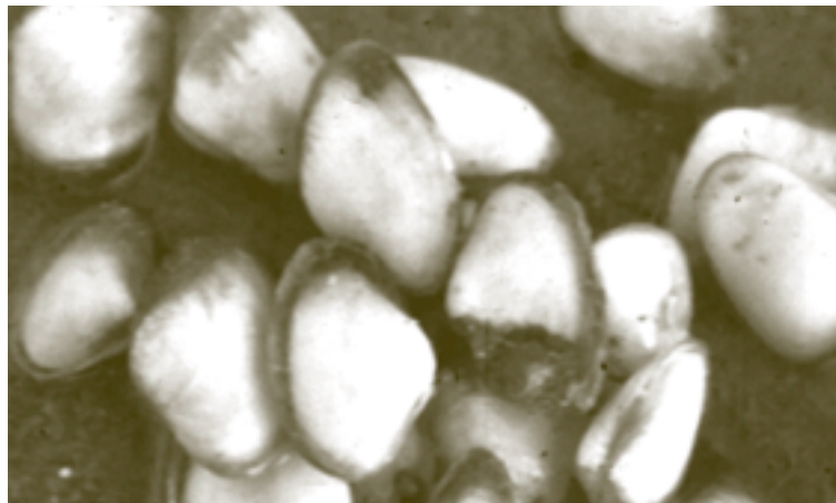
Figure 2. Introduced from Asia in ballast water, Potamocorbula amurensis had become the most abundant clam in northern San Francisco Bay nine months after it was noticed. ANDREW N. COHEN

in the northern part of San Francisco Bay (fig. 2). Researchers estimated that virtually the entire water column was filtered by these clams between once and twice a day, essentially vacuuming the food out of the water. The clams also concentrate selenium in their tissues, so that fish and birds that eat them are accumulating selenium at levels that are known in experimental studies to cause reproductive defects.