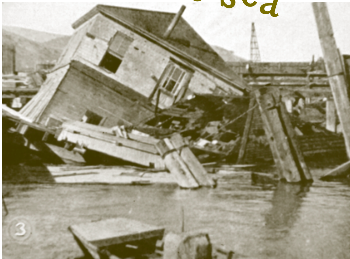
Figure 1. The collapse of the Benicia wharf and customs house in San Francisco Bay on October 7, 1920, was caused by the Atlantic shipworm, Teredo navalis . FROM R. M. NEILY, HISTORICAL DEVELOPMENT OF MARINE STRUCTURES IN SAN FRANCISCO BAY, IN “FINAL REPORT OF THE SAN FRANCISCO BAY PILING COMMITTEE” (1927).