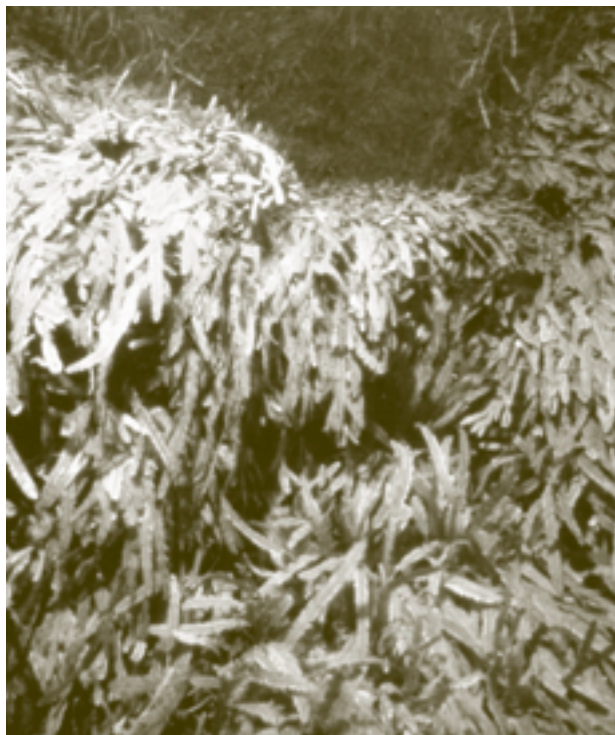
Figure 7. The tropical aquarium seaweed, Caulerpa taxifolia , overgrowing a rocky substrate in the Mediterranean Sea near Monaco. ALEX MEINESZ

Also in California, a South African shell parasite, the sabellid worm Terebrasabella heterouncinata , widely infested abalone farms and escaped into the environment in at least one site. This parasite can deform and halt the growth of all West Coast abalone species—whose populations are already in rapid decline, with one near extinction—as well as other marine snails. It can invade habitats from intertidal rocky shores to subtidal reefs, where reducing snail populations could alter seaweed communities, thereby affecting habitat and food resources for many other species.